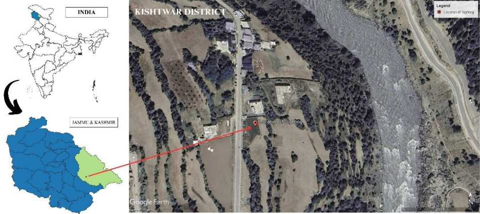
Figure 1. Location map of Partially Leucistic Rock Bunting sighting.