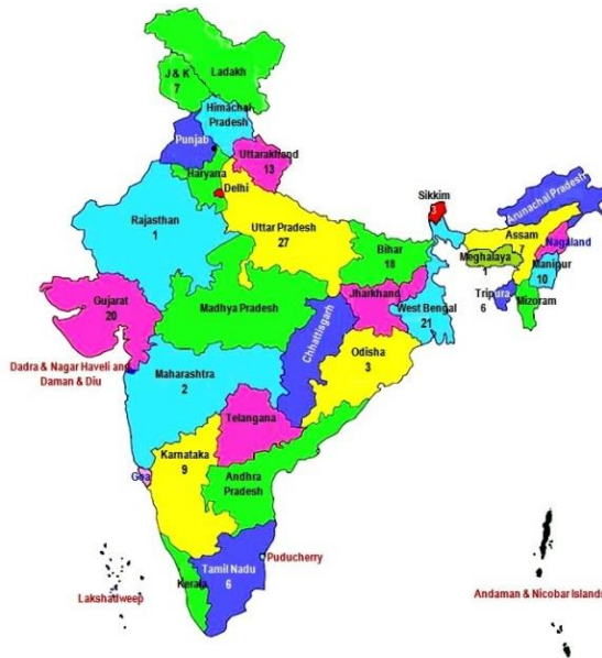
Figure 2. Map showing the number of tritrophic association of aphidophagous hoverflies (Syrphidae) preying on Aphis (Aphis) gossypii Glover in different states and union territories of India.

3. Family: Syrphidae: The Syrphidae is highly economically important family as the adult flies are pollinators and thus productive in nature while larvae of many species are protective by feeding and thus killing of several insect pests including aphids (Joshi et al., 2023). In India, 24 species are recorded preying on Aphis gossypii infesting 36 species of host plants in 16 states/union territories. Its tritrophic associations in different parts of India is illustrated in Figure 2.